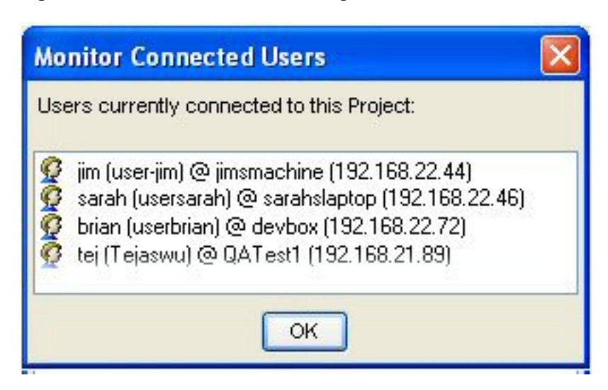
Figure 3. Monitor Connected Users Dialog Box