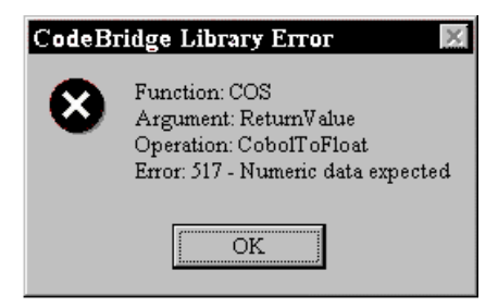
Figure 1: Library Error Message Box

For Windows platforms, a message box with the error message is displayed. Figure 1 shows an example of a CodeBridge Library error message on Windows: